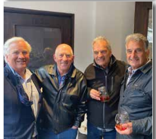
70 members attended Cigar and Steak night. Look for the next one to be scheduled in late 2021.