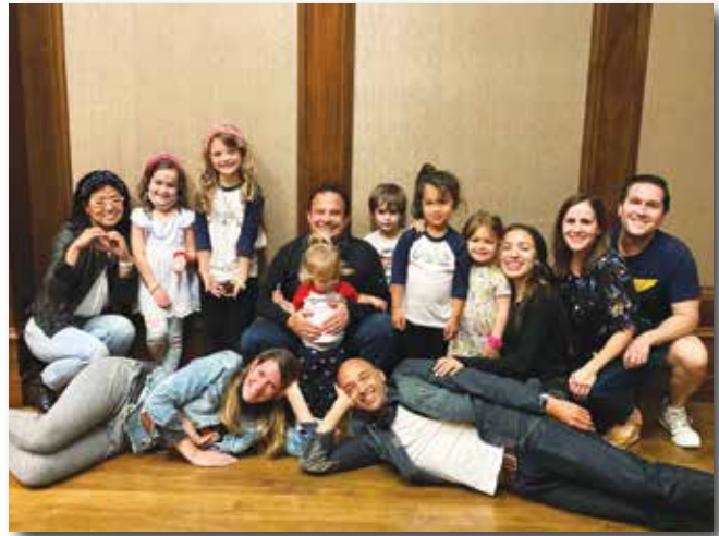
The “scooter gang” says farewell to their Friday nights at the Club with many new friendships made.