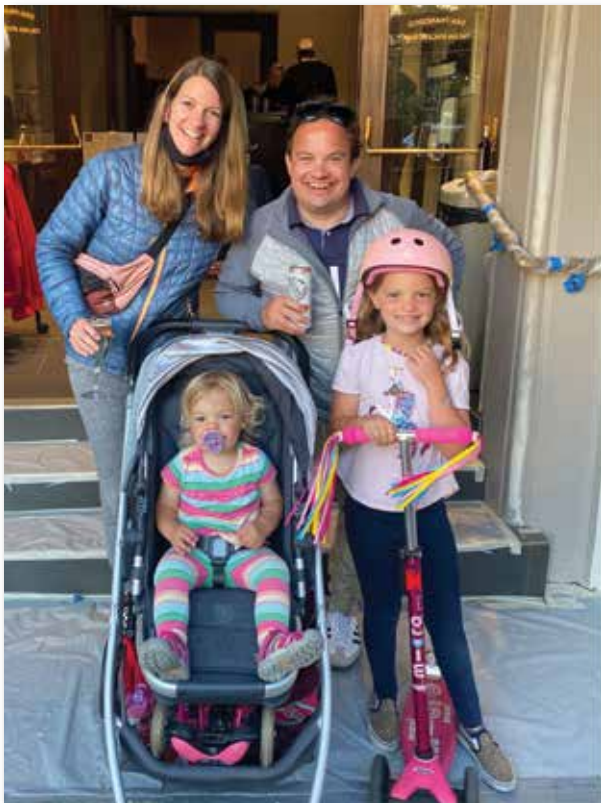
If there were a Porta Via frequent flier program the Mastrangelo family would have achieved lifetime elite status.