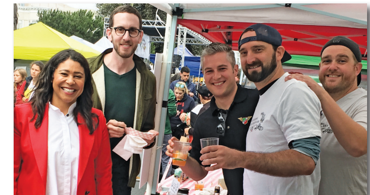
Mayor London Breed, Sen. Scott Wiener and the spritz crew