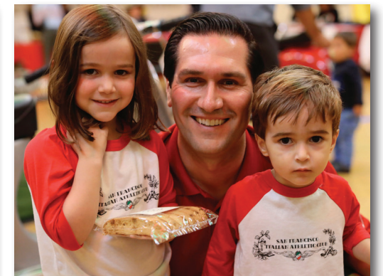
Figone Family modeling their new club tees