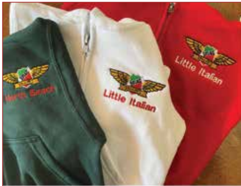
SFIAC Zip Up Hooded Sweatshirts Toddler "Little Italian" 2T-4T in white or red $30 Youth "North Beach" XS-XL in green or white $35