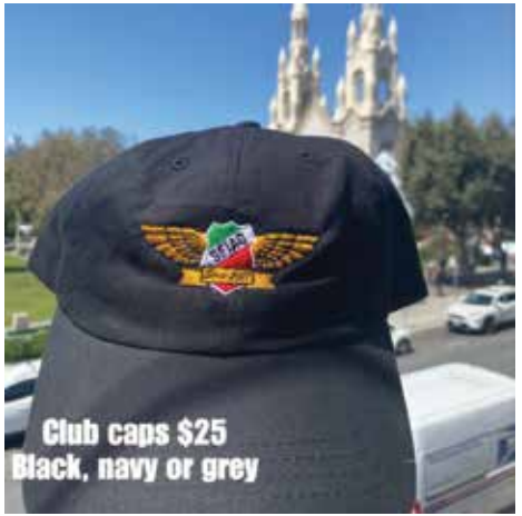
Club caps $25 Black, navy or grey

Shop the SFIAC online and in person this Christmas! We are pleased to announce that we are opening our first online shop. We will start with just a few items; but, we are looking forward to expanding our selection in the months to come. Our shop can be found on instagram @sfitalianathleticclub and SFIAC.org. We are constantly updating our instagram feed with new items. If you would like to order something seen here and not online contact 415.781.0166 or keely@sfiac.org. We ship!