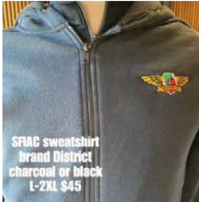
SFIAC sweatshirt brand District charcoal or black L-2XL $45

Celebrate the holidays with food and gifts from the SFIAC. We will be selling merchandise, ravioli, wine and more at our events in November and December. Stop by to pick up a jar or case of the new Carbone original pasta sauce as served at the Italian Heritage Parade. We will be posting holiday wine sales on Instagram and in the news blast.