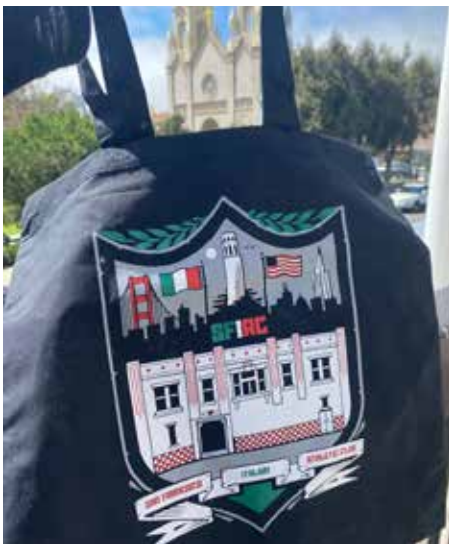
SFIAC Jeremy Fish original tote $20 Proceeds support SFIAC Foundation

Celebrate the holidays with food and gifts from the SFIAC. We will be selling merchandise, ravioli, wine and more at our events in November and December. Stop by to pick up a jar or case of the new Carbone original pasta sauce as served at the Italian Heritage Parade. We will be posting holiday wine sales on Instagram and in the news blast.