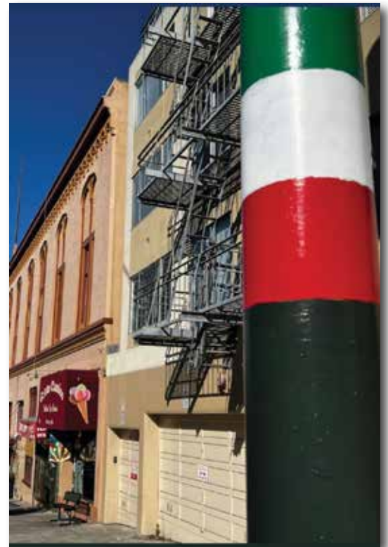
Gelato Classico and our other neighbors on Union Street appreciate the refresh.