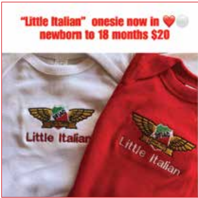
"Little Italian" onesie now in newborn to 18 months $20

Shop the SFIAC online and in person this Christmas! We are pleased to announce that we are opening our first online shop. We will start with just a few items; but, we are looking forward to expanding our selection in the months to come. Our shop can be found on instagram @sfitalianathleticclub and SFIAC.org. We are constantly updating our instagram feed with new items. If you would like to order something seen here and not online contact 415.781.0166 or keely@sfiac.org. We ship!