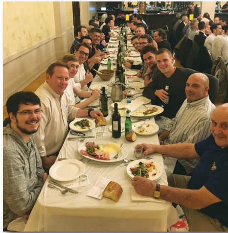
The SFIAC soccer team enjoys cioppino stag.