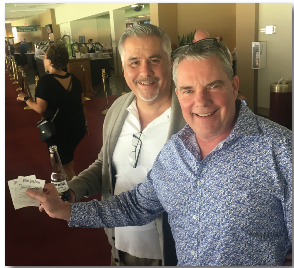
Great time had by all at the SFIAC Day at the Races. We even had some big winners!