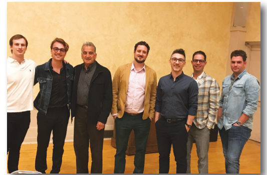
April's new member class.