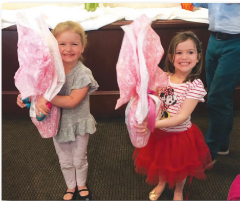
Bunny Brunch: Huge smiles when the chocolate eggs are almost the same size as you.