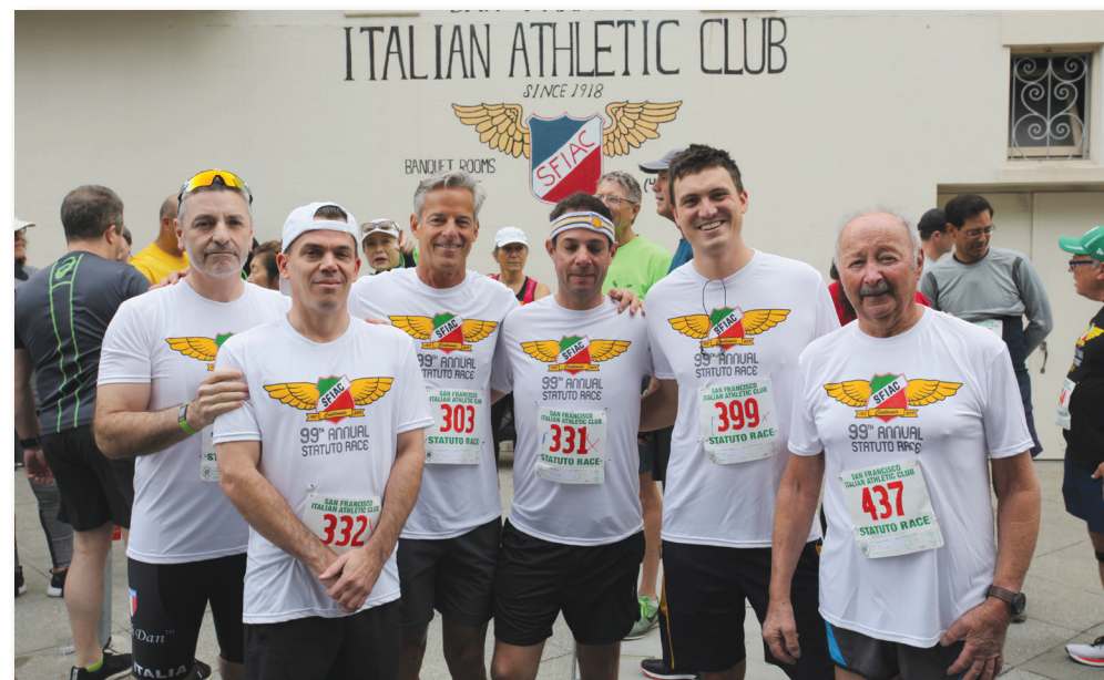
SFIAC members run for the Statuto Cup