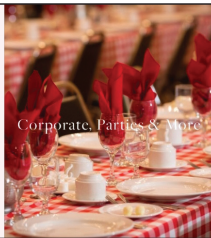
Corporate, Parties & More

Host your next gathering at the Club. Weddings, graduation, birthday or corporate event, we have the space for you. www.SFIAC.org events@SFIAC.org