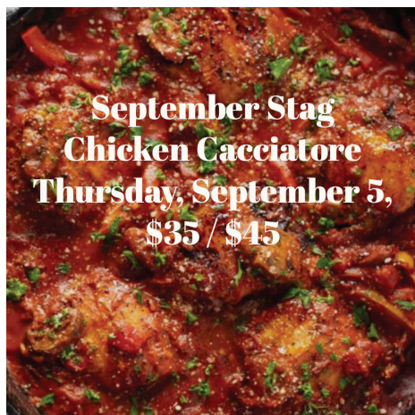
September Stag Chicken Cacciatore Thursday, September 5, $35 / $45

Price: $60 per person. Purchase tickets online at www.SFIAC.org or through the Club office at 415.781.0166.