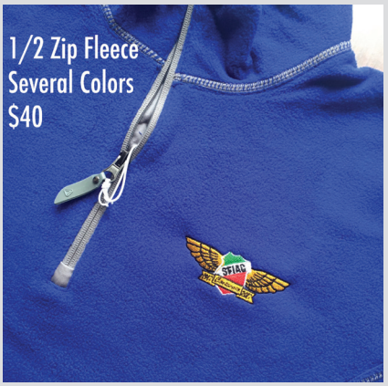
1/2 Zip Fleece Several Colors $40

Nike Golf Dri-Fit 1/2 zip cover ups in black S-2XL $85. New women's fleece in black, red and royal blue. Wind-breaker $40, black long-sleeved fleece $40, 100-year centennial t-shirts in red, royal, navy and black $20, SFIAC clock $35. We have two types of logo sweatshirts in three different colors. Antigua zip ups in navy and pine green and pull overs in red and pine green. Available S - 2XL $40. See our Instagram page for more pictures @sfitalianathleticclub. Visit the members' bar or contact Gina at gina@SFIAC.org for purchase.