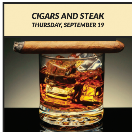
CIGARS AND STEAK THURSDAY, SEPTEMBER 19