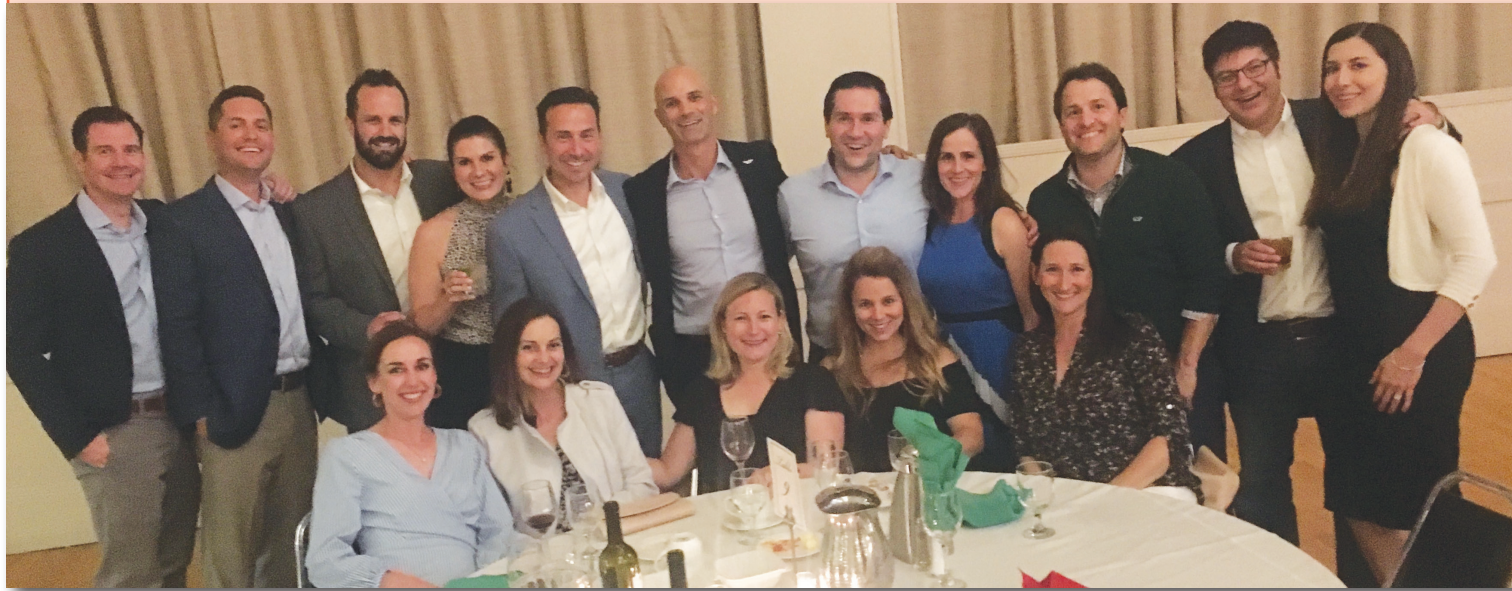
Thank you to our members and their guest for their generous support.