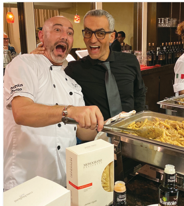
The Terun team serving their amazing pasta dish.