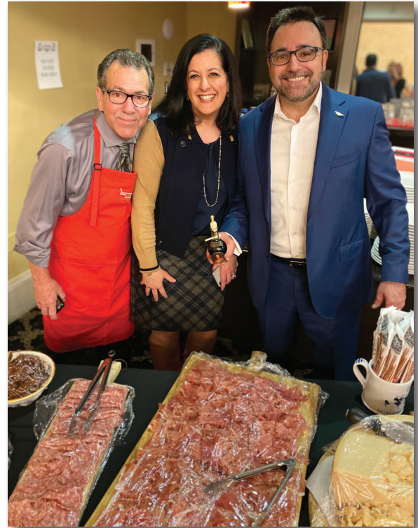
talfoods provided amazing antipasti