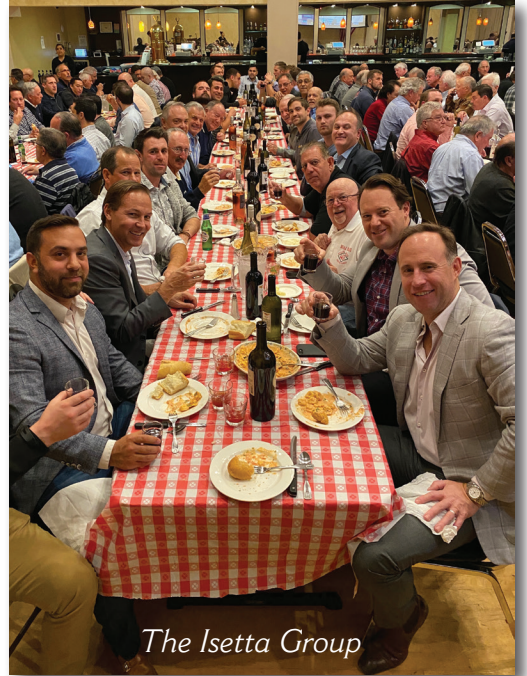
The Isetta Group