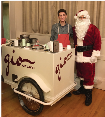
Reserve the Gio Gelati cart for your next event.